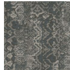
Heritage 85530 LRV 14.6