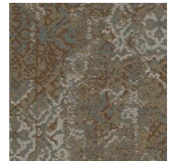
Nostalgic 85665 LRV 16.2